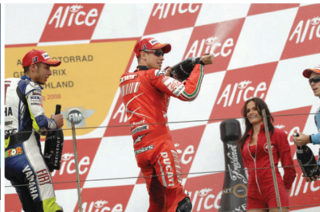
Casey Stoner leads the all-Bridgestone podium at wet Sachsenring